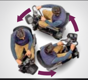
Exclusive EZ Turn Technology on 4-Wheel Model

The Go Go® Sport delivers high-performance and convenience on the go. With a 325 lb. weight capacity, a charger port in the tiller, standard front LED lighting and a maximum speed up to 4.7 mph., the Go Go Sport is feature rich and travel ready.